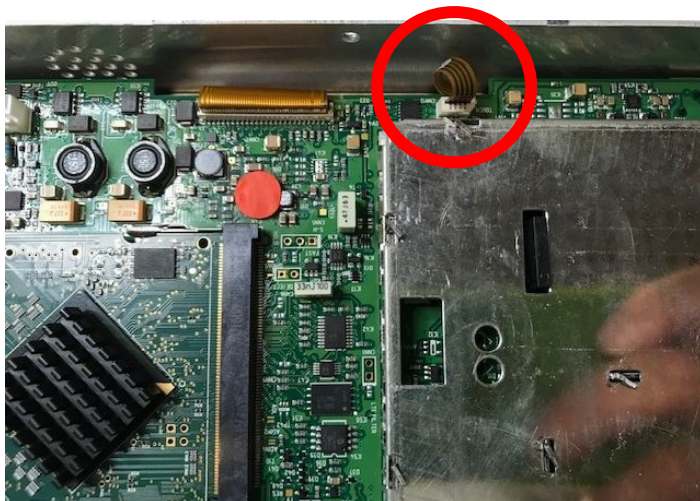
Fig.2 twisted touch screen flat cable for new display type.